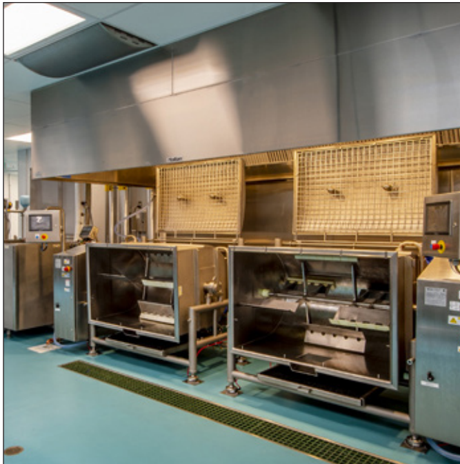
Two, 200-Gallon Tilting Versa Vessels tilted forward for agitator removal and easy cleaning

The TUCS TILTING VERSA VESSEL is a low rim height, tilting, trough-shaped vessel with a horizontal mixing scraper agitator for the production of liquid, semi-viscous and viscous products (soups, sauces, stews, mashed potatoes, refried beans, etc.). This agitator lifts the heavy particulate off the bottom and moves them to the top while pulling the floating particulate to the bottom, in a gentle mixing, folding action. The vessel has a 3" air-operated, flush-mounted drop-down valve for the attachment to a Tucs volumetric piston pump or other pumping devices. Pre-piped for single-point attachment to utilities and a complete integral digital control panel with a pendant mounted digital HMI. This model is unique in that it has recipe storage and verification with the use of load cells. It also has steam injection with culinary steam for rapid cooking. This model has a spray ball or balls used for rinsing the vessel. The vessel can be sanitized with live, low-pressure steam.