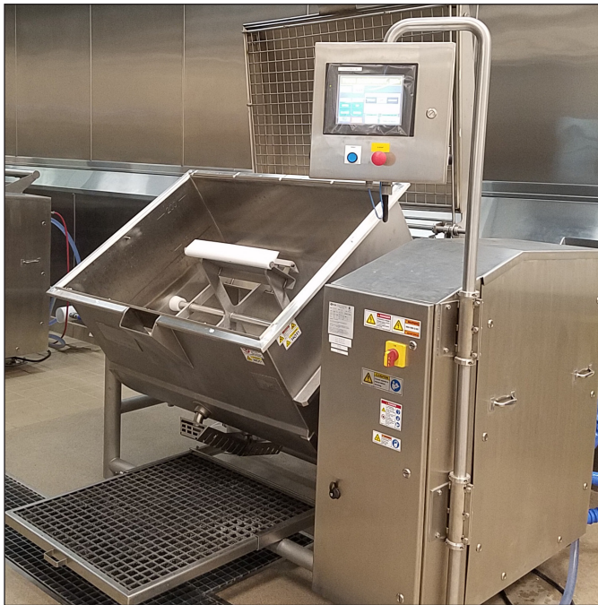
TECV-200T shown tilted forward for easy cleaning

The TUCS TILTING COOKING VESSEL is a low rim height, tilting, trough-shaped vessel with a horizontal mixing scraper agitator for the production of liquid, semi-viscous and viscous products (soups, sauces, stews, mashed potatoes, refried beans, etc.). This agitator lifts the heavy particulate off the bottom and moves them to the top while pulling the floating particulate to the bottom, in a gentle mixing, folding action. An optional variety of blending agitators for different products are available upon request (protein and non-protein salads, meat mixtures, etc.). The vessel tilts to pour out liquids, aid in the discharge of solid non-pumpable products and provide access for easy cleaning. The vessel has a 3" air-operated, flush-mounted drop-down valve for the attachment to a Tucs volumetric piston pump or another pumping device. Pre-piped for single point attachment to utilities and an integrated digital control panel with a pendant mounted digital HMI.